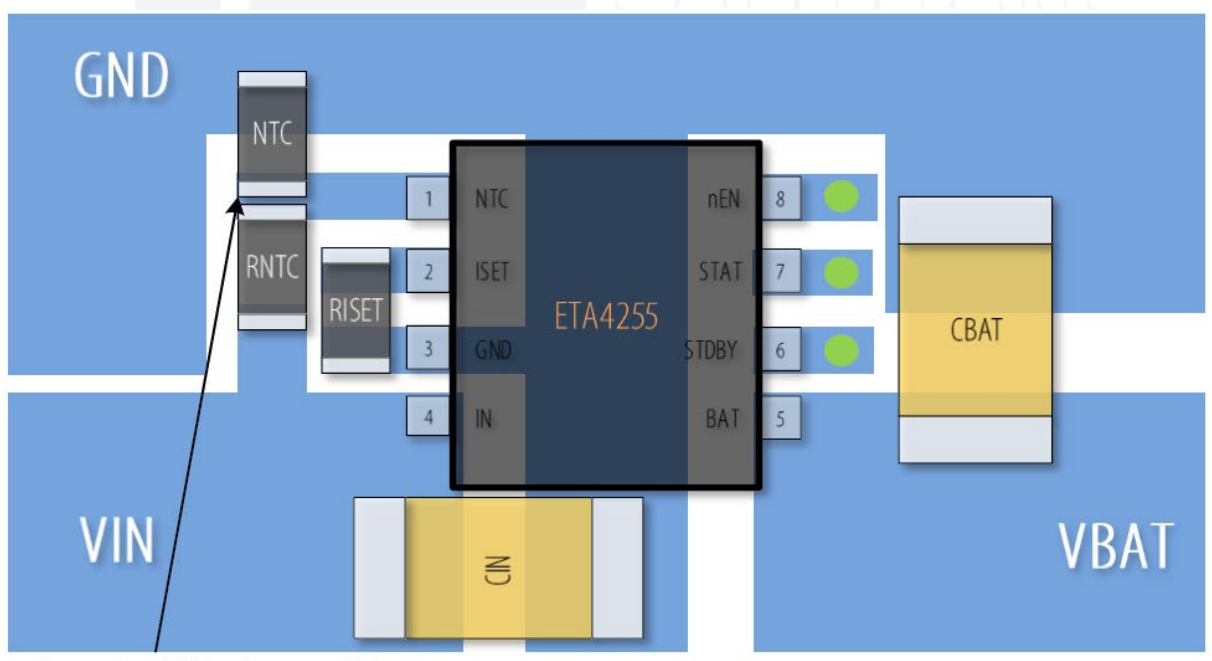
Please place NTC resistor near high temperature area